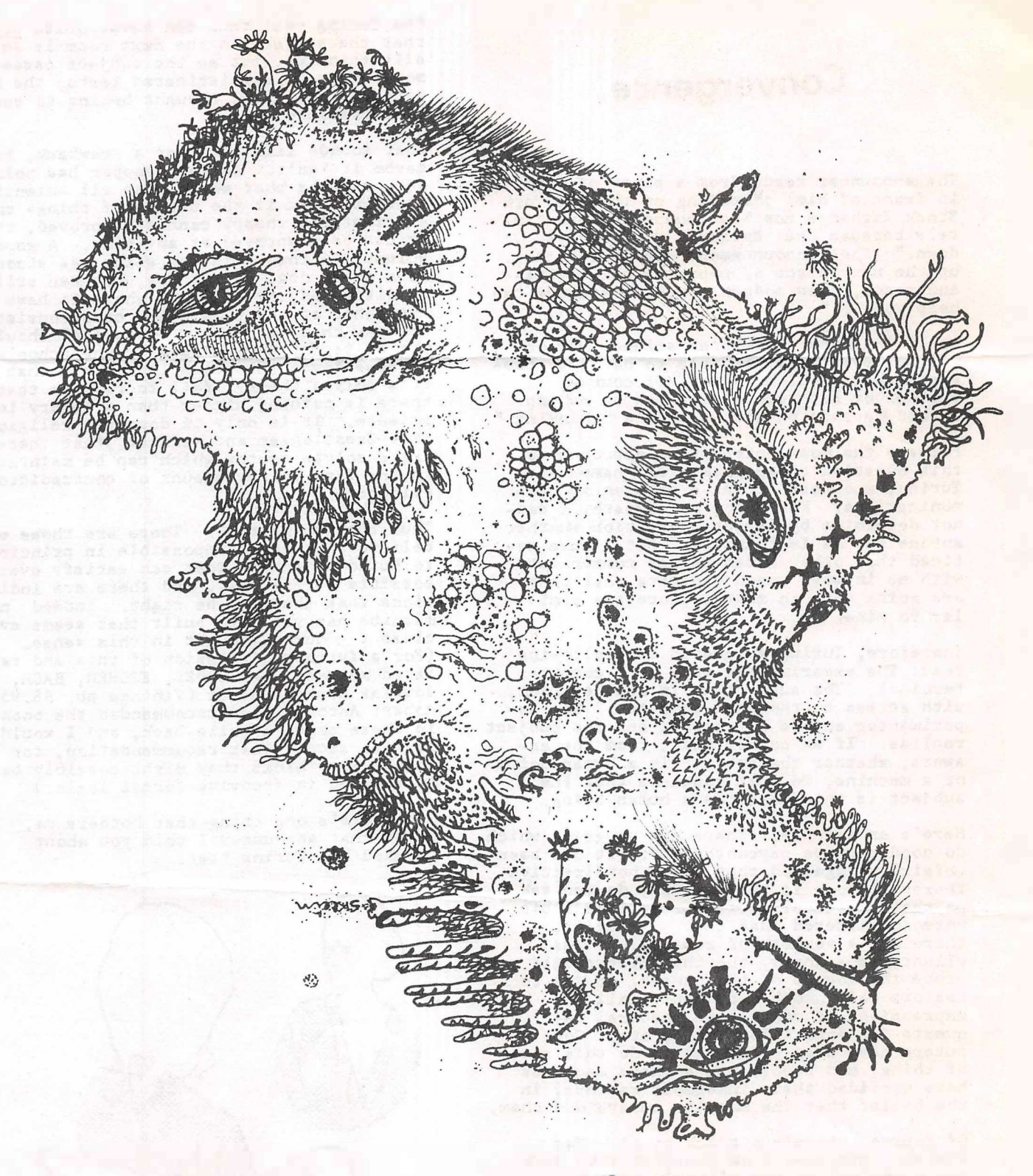
Another Artist's View of the 3 men on the cover